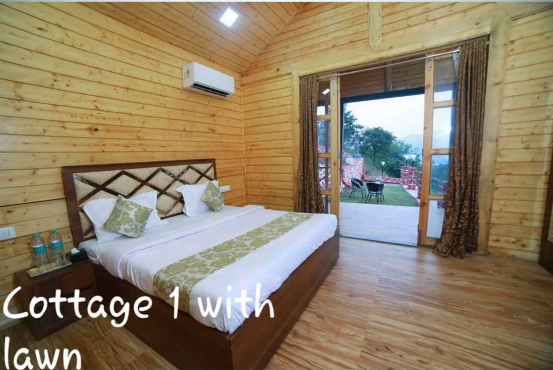
Cottage 1 with lawn